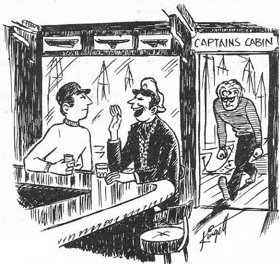
"They were near the finish line . . . barely ghosting along . . . playing every cat's-paw for what it was worth . . . and then my wash hit them. You should've seen their faces . . .!"