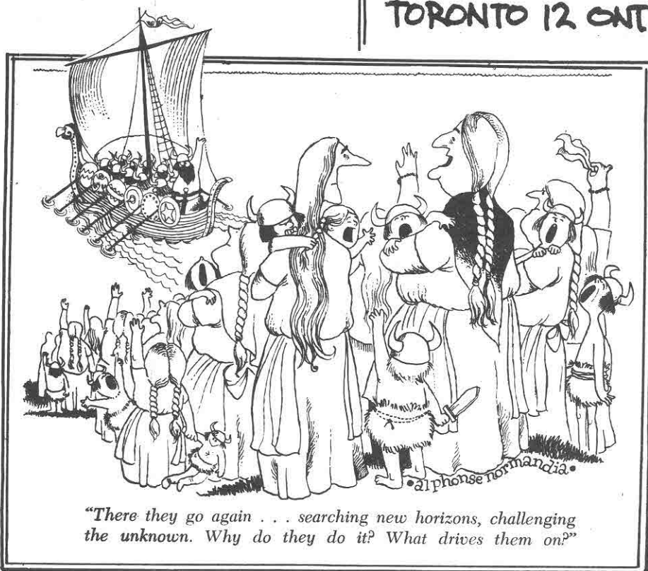
"There they go again . . . searching new horizons, challenging the unknown. Why do they do it? What drives them on?"